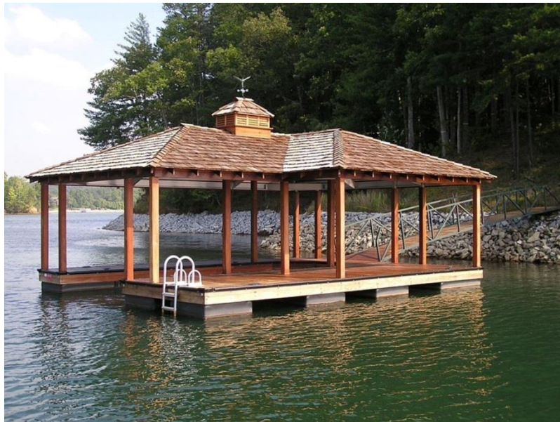
Figure 2. Example of covered mooring